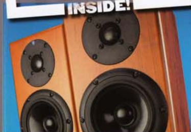
TOTEM Rainmaker speaker delivers music with gusto