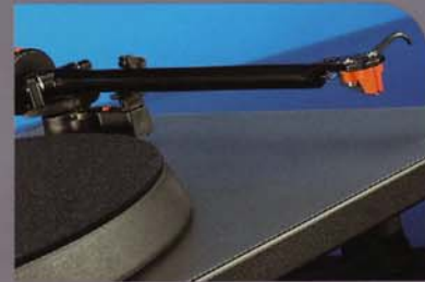
REGA Classic turntable now sounds better than ever