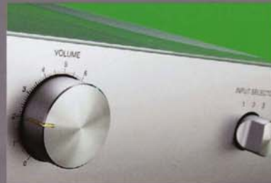
FLYING MOLE Latest digital amp is a sonic revelation